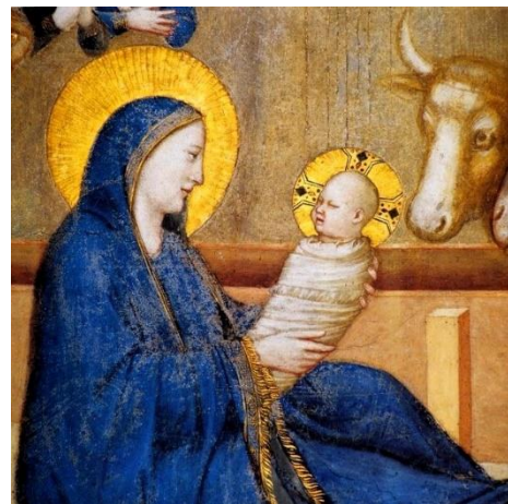
From The Nativity by Giotto