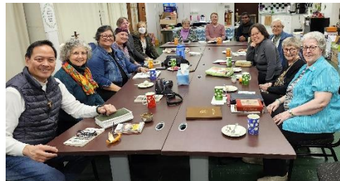
St Agnes of Assisi Fraternity Coquitlam, BC