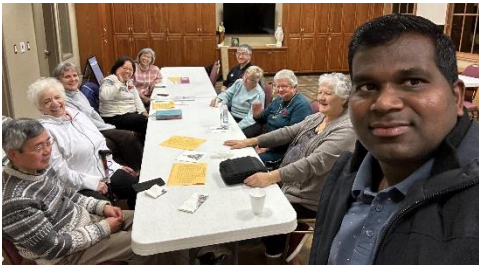
St Clare of Assisi Fraternity Chilliwack, BC