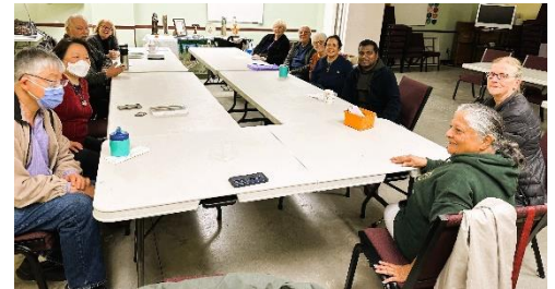
St Clare of Assisi Fraternity Coquitlam, BC

Christmas Question: What are the names of The Three Magi referred to in Matthew 2:7-12?